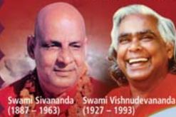
Swami Sivananda (1887 - 1963) Swami Vishnudevananda (1927 - 1993)

The programme includes one week at the Kumbha Mela in Hardwar, plus a week of yoga Sadhana in Uttarkashi, Himalayas